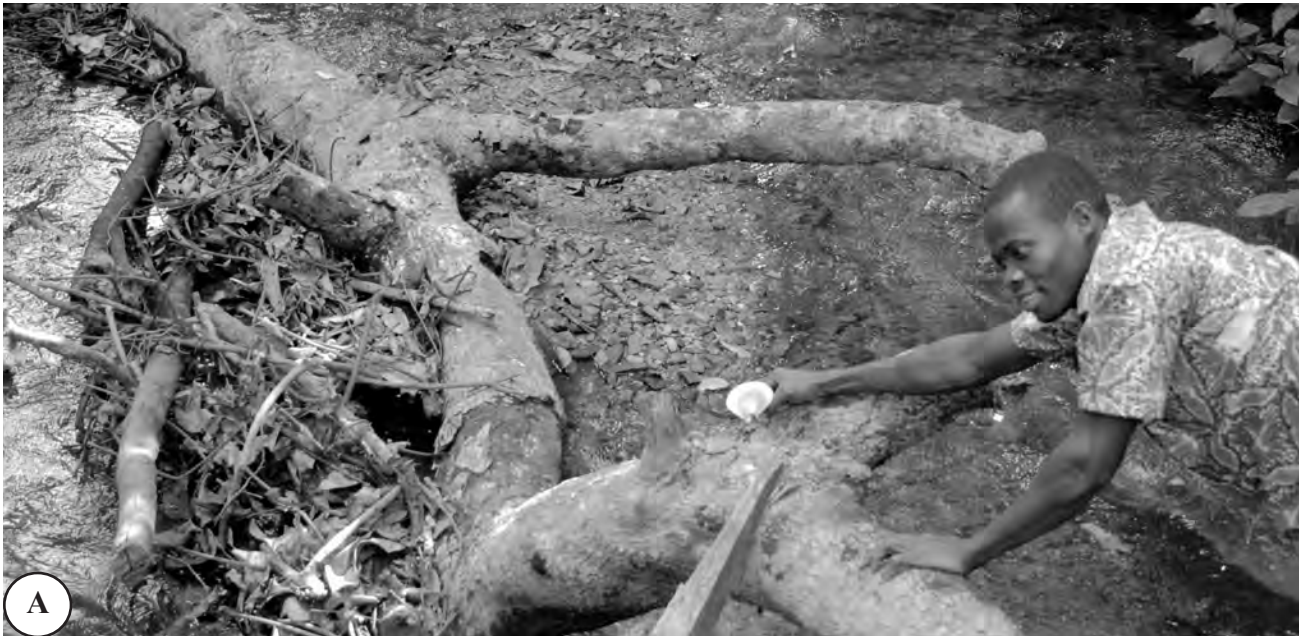
Fig. 3. Ghana. Below, A: Collecting a wild oyster mushroom near Wli Falls. Opposite page, B: Mud-thatch mushrooms house, left, center. To right, men dumping water into pasteurization tank. Man carrying water to the tank and rack where straw had been kept. C: Lecturing to prospective mushroom farmers. D: Checking the pasteurization. E: Those who attended the pasteurization – spawning demonstration.